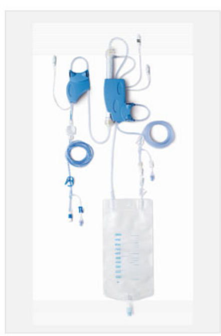
Blood Circuit Set