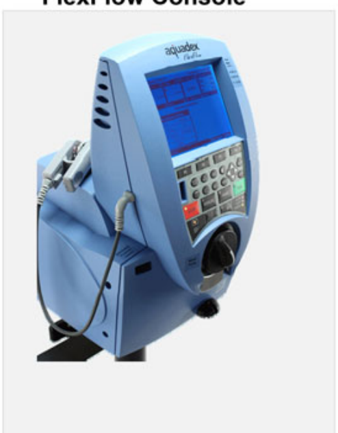
Aquadex FlexFlow Console